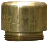
3129-10 Pipe Away Adapter